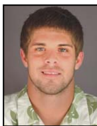
Colt Brennan Hawai'i