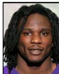
Chris Johnson East Carolina