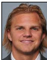
Jimmy Clausen Notre Dame