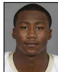
Brandon Marshall UCF